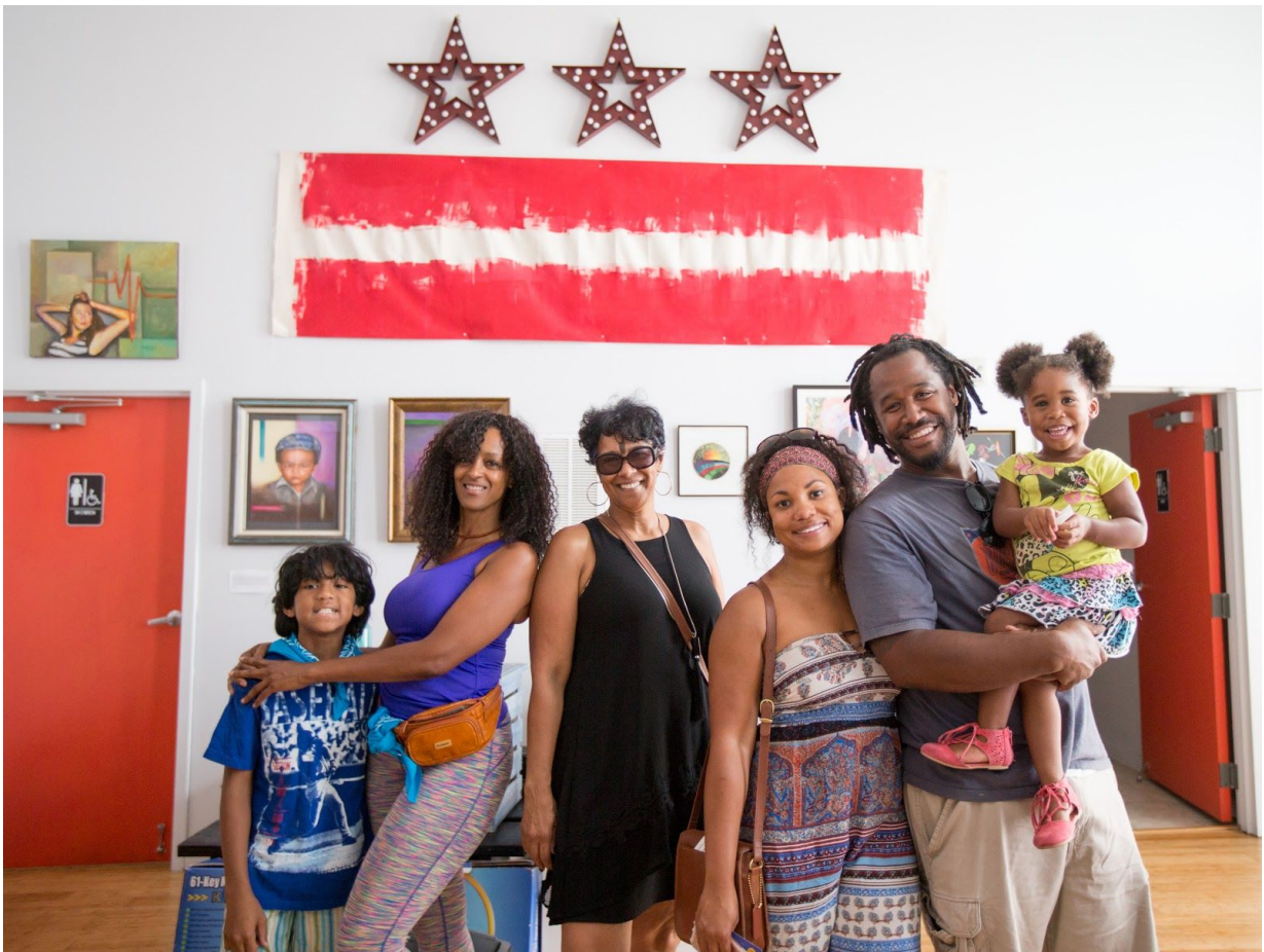
Airbnb hosts at Anacostia Arts Center (September 8, 2017)

Home Sharing: Creating $3.75 Million in Supplemental Income for Ward 7 and Ward 8 Families